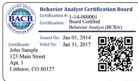
Sample Wallet Card Front

The BACB now offers wallet cards for its certificants through the BACB Gateway. The wallet card includes the certificant's name, mailing address, certification type, certification #, initial certification date, and certification expiration date. In addition, the card includes a bar code embedded with the certification # and a QR code embedded with the name, certification #, and certification expiration date. We anticipate that approved continuing education (ACE) providers will increasingly use scanners to record your attendance at continuing education events. You should take this card with you to these types of events to facilitate more efficient processing of your continuing education units.