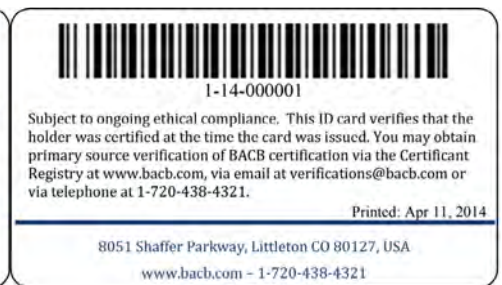
Sample Wallet Card Back

To access your wallet card, go to the BACB Gateway and click on the Profile tab. Your card is available by clicking on the Print ID Card link located at the bottom of the My Profile Information section (see below).